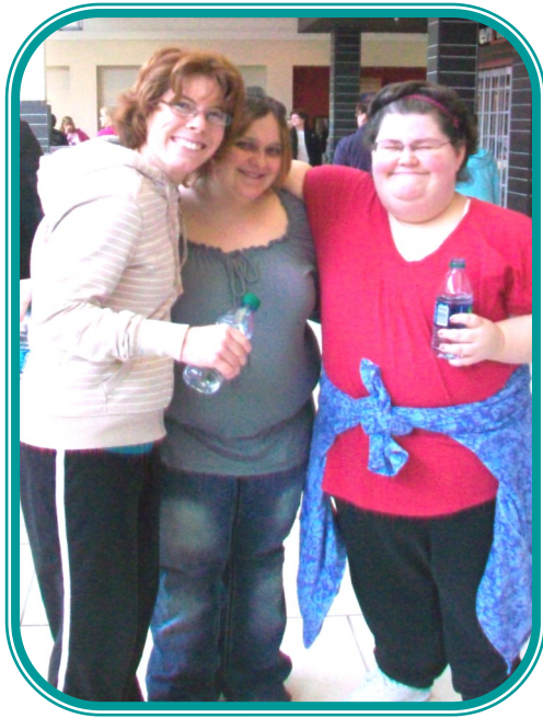
C.O. group members participating in the Stride 4 Survive Walk at the River Valley Mall!